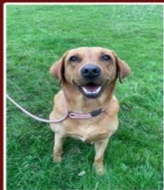
Menna Wellbeing Dog