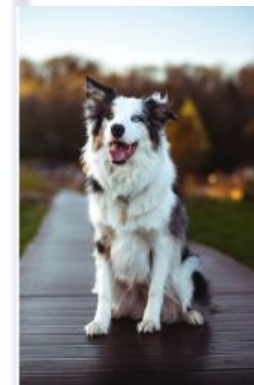
Ozzy School dog