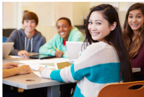
Options at 18