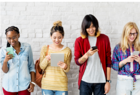
Options at 16