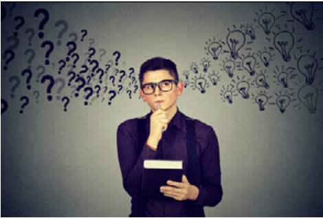
How to choose the right subject or course