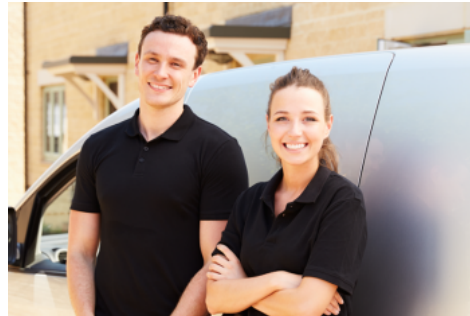
Getting into Self-employment