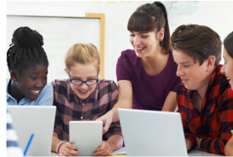
Choosing subjects and courses at 16