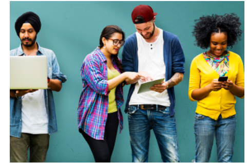
Choosing subjects and courses at 18