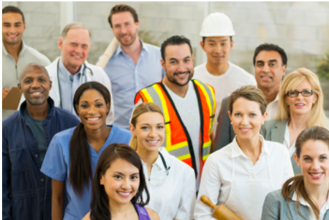
Getting a Job